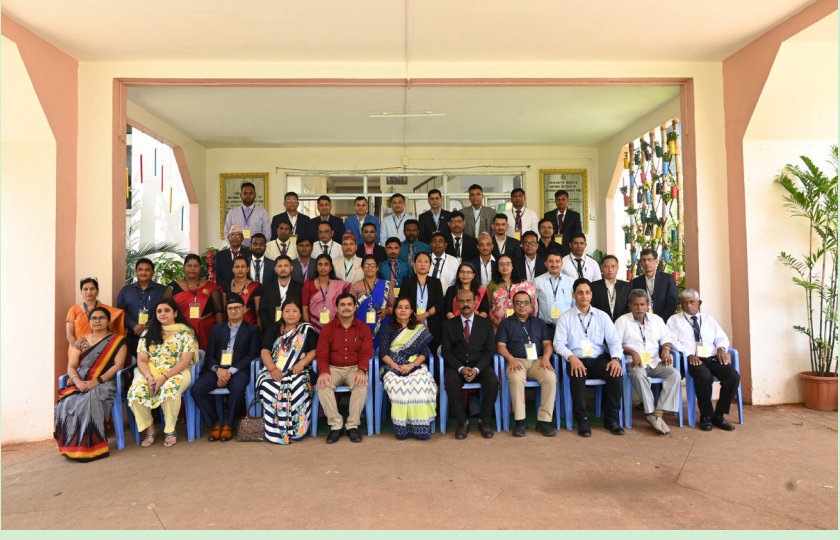
Group photo of the programme