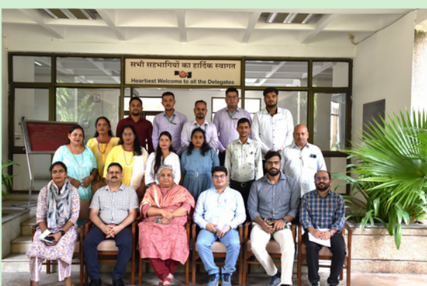
Group photo of of the programme