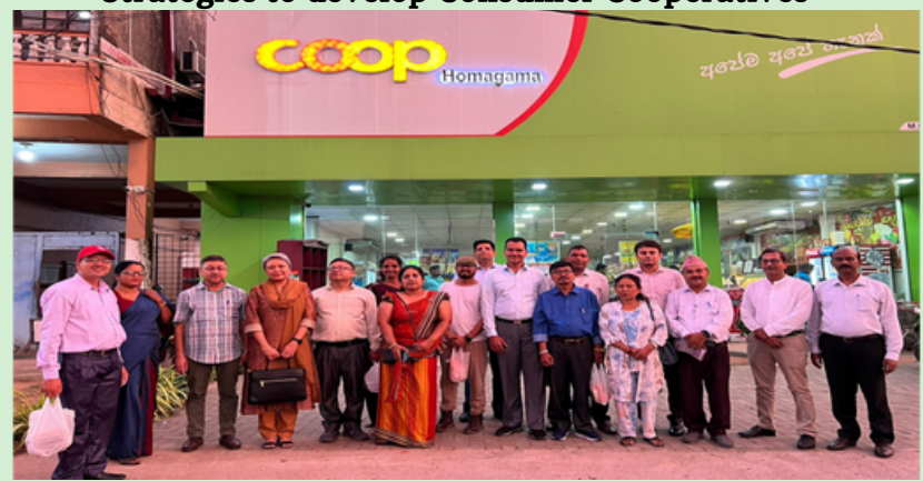
Study Visit to Homagama Multipurpose Cooperative Society