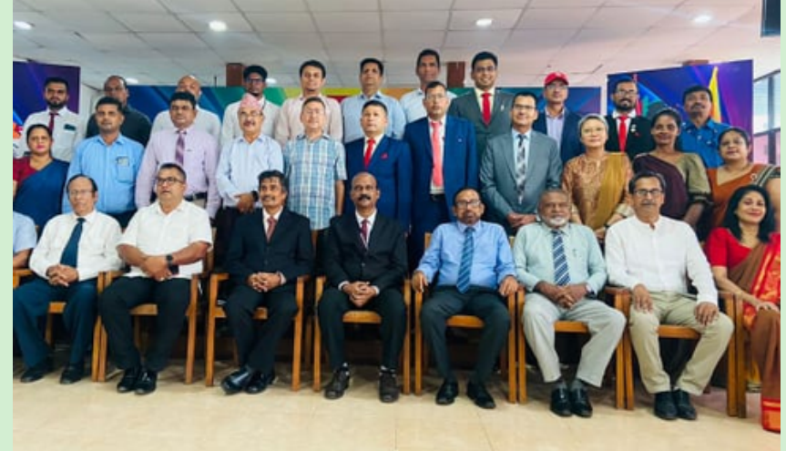
Group photo of the international programme on "Management Strategies to develop Consumer Cooperatives"