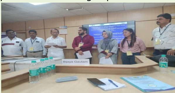
Group I discussion and presentation