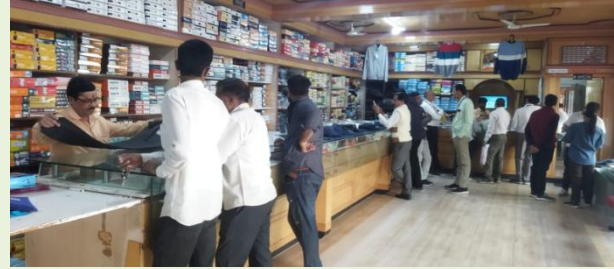
Readymade Clothing Department