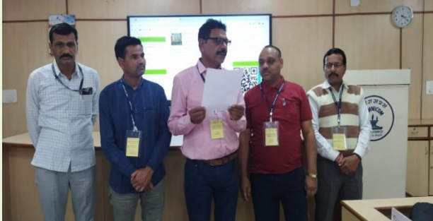
Group V discussion and presentation