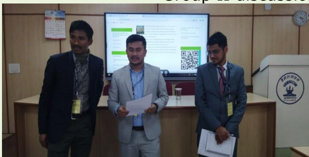
Group III discussion and presentation