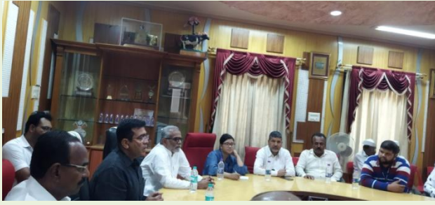
Chairman and Board of Directors briefed about Kashti Vividh karykari Seva Sahakari Society Ltd Kashti