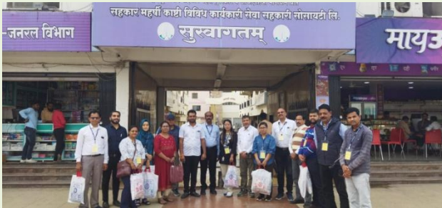
Group photo at Kashti Vividh karykari Seva Sahakari Society Ltd Kashti