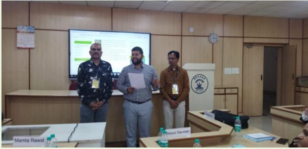
Group IV discussion and presentation