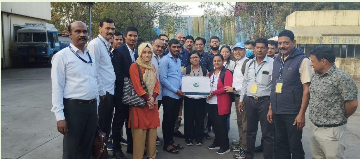
Study visit at Katraj Dairy. Token of love was given by CICTAB to the Katraj Dairy officer for sharing the information

capacity, health services to the cows, maintaining credit system, introducing hybrid cows and grades, Cow dung and bio waste used for energy making : 3 tons per hour and The gas is using to chilling milk.