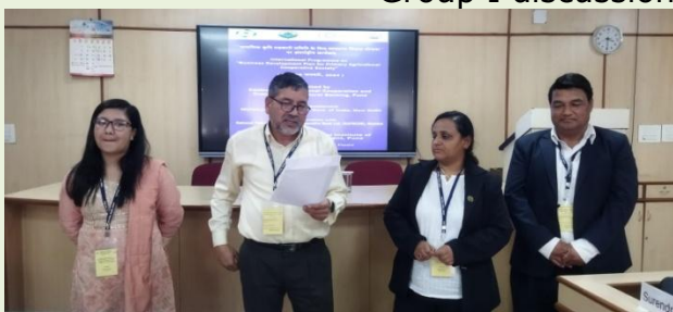
Group II discussion and presentation