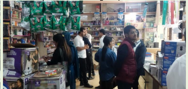
Household Appliance Department